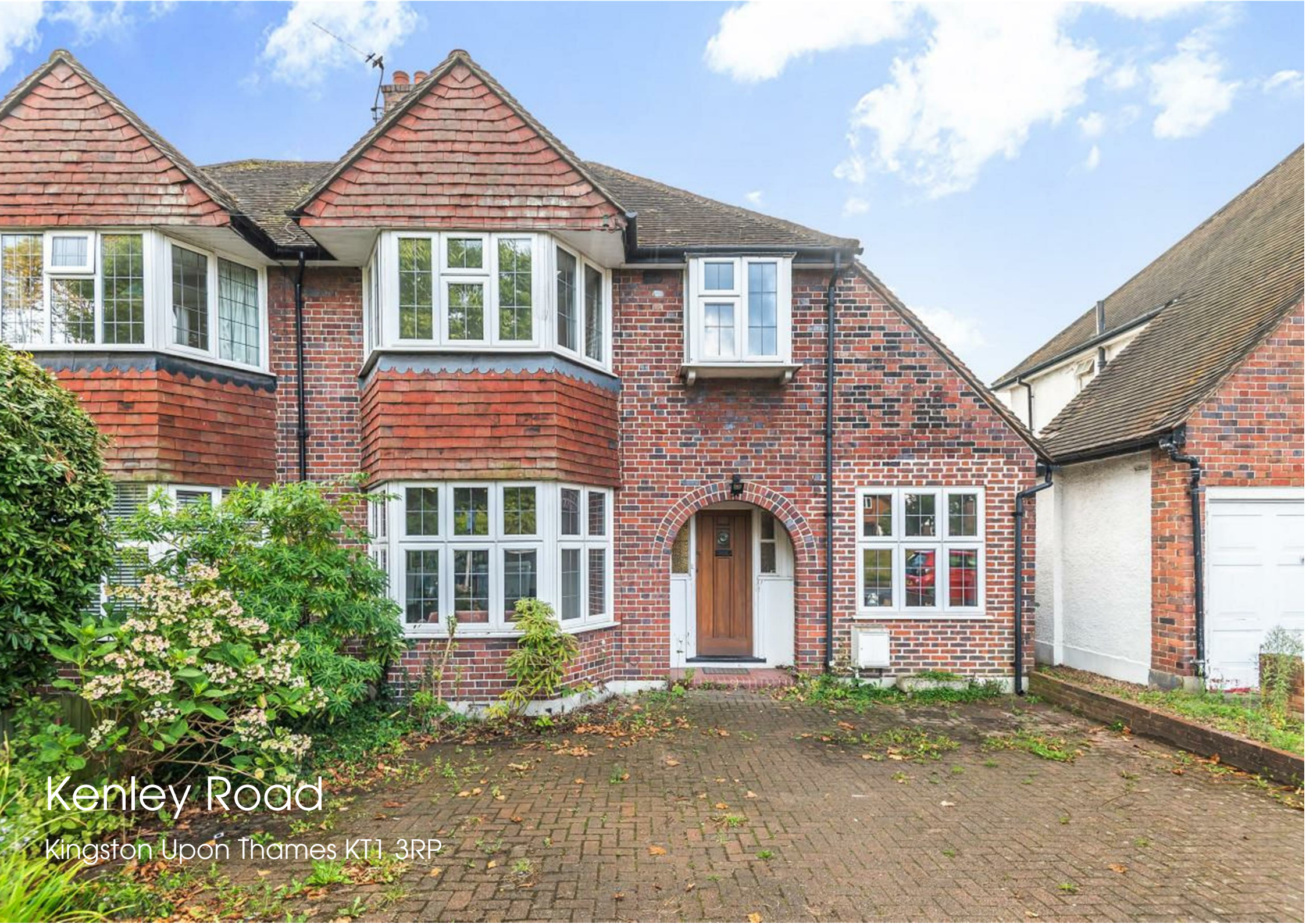
Kenley Road Kingston Upon Thames KT1 3RP

34 Richmond Road Kingston upon Thames Surrey KT12 5ED www.gibsonlane.co.uk Tel: 020 8546 5444